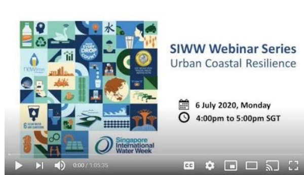
Urban Coastal Resilience

Missed these webinars, or just want to watch them again? Catch the recordings in the links below. To continue the conversations, join us at SIWW 2021.