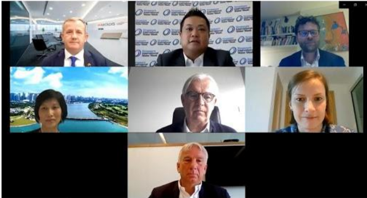
Photo from Urban Coastal Resilience webinar