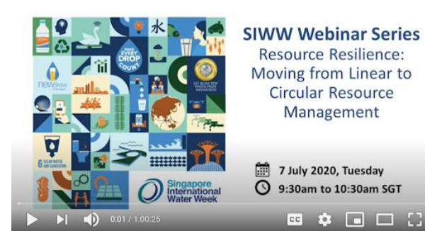
Resource Resilience: Moving from Linear to Circular Resource Management