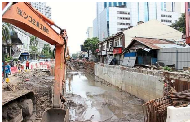
Flooding to third party property due to project work