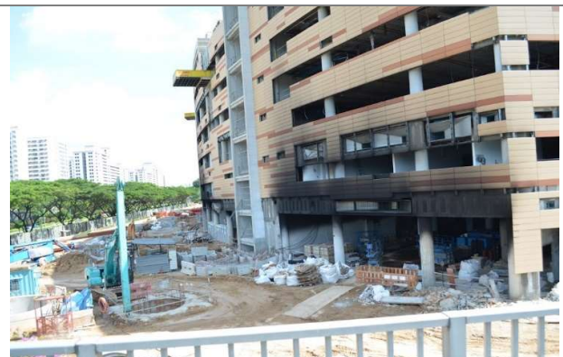
Fire damage to building under construction