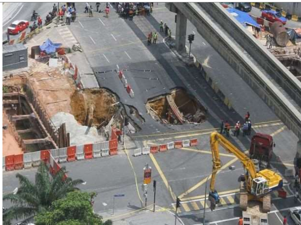
Sinkhole on existing road due to excavation works