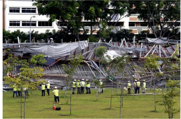
Collapse of bridge formwork during concrete pour