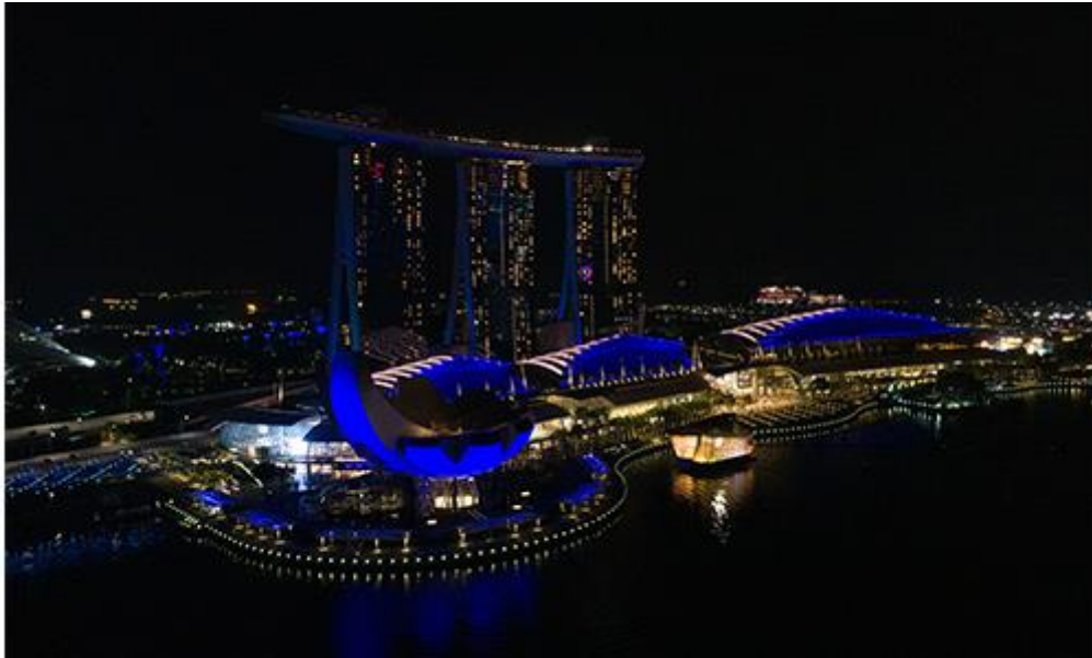
Singapore City Turns Blue for World Water Day on 22 March.