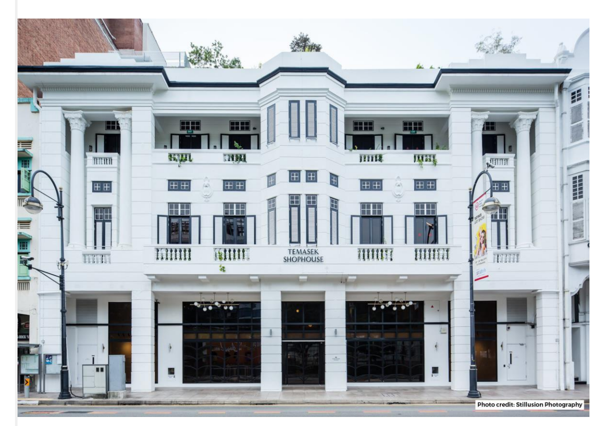
Architectural Heritage Awards now open for nominations

The Architectural Heritage Awards (AHA) are back! Refreshed to recognise more stakeholders and celebrate both the tangible and intangible legacy of our heritage assets, the AHA will also see a new award introduced to applaud past winners for exemplary management of their heritage developments.