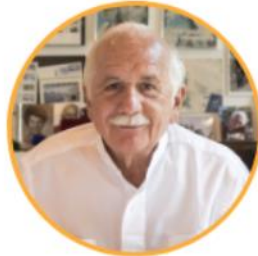
MR. MOSHE SAFDIE Founder, Safdie Architects

While the growth of cities is inevitable, new cities also present tremendous opportunities for the built environment to rise to the challenge in making positive impact towards climate change. Join us in delving deeper into the power of design and sustainable planning in shaping a climate-friendly built environment.