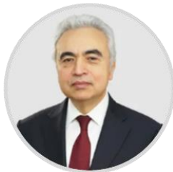
DR FATIH BIROL Executive Director International Energy Agency (IEA)