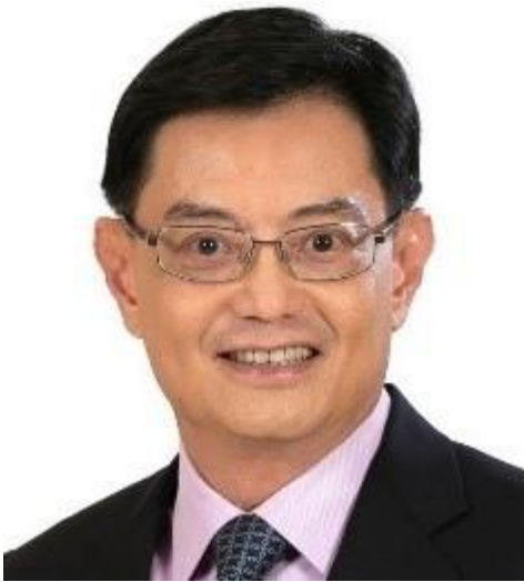
Heng Swee Keat Singapore's Deputy Prime Minister and Coordinating Minister for Economic Policies