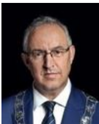
Ahmed Aboutaleb Mayor, City of Rotterdam