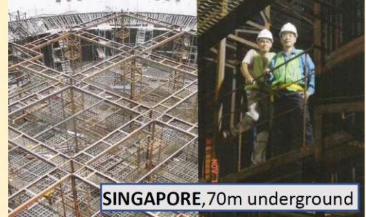
SINGAPORE, 70m underground